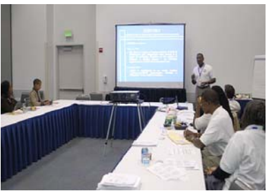
ALOM 2006. Anaheim. CA

information, please contact The IJoshua Group at (404) 4559-6191.